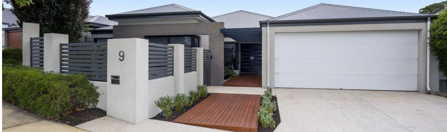
9 Edgehill Walk, Piara Waters